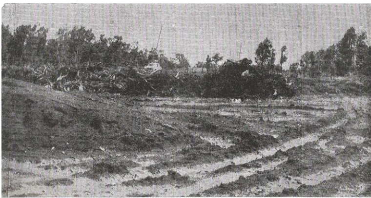
The dump area being prepared at Ludmilla. Heavy rains churned up the cleared area.

Illustration 6 , above left: Darwin City council Mayor, Alderman Ken waters displays proposed plans for land fill site after completion of Ludmilla Dump. Plans seem to indicated a golf course and park land. NT News , January 1, 1971, page 6.