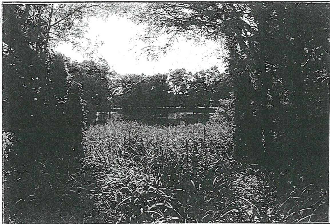
One Mile Railway Dam

The Present: One Mile Railway Dam is located below Dinah Beach Road and just above the maximum high tide mark within the Railway Dam town camp (lot 5027). The dam is spring fed and also receives runoff from some of the C.B.D.'s storm water drains. It is delightfully set amid trees and is a favourite swimming hole for children living in the town camp but is often polluted with street waste including used syringes.