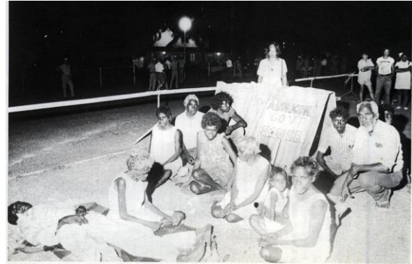
Left: The petition to the Queen. Right: Campers outside Government House waiting to deliver the petition on the night of October 16 th , 1972.

The plan was to set up an alternative ‘Aboriginal Government House on the lawns outside the entrance to Government House for the duration of the October visit to Darwin of Princess Margaret and Anthony Armstrong Jones.