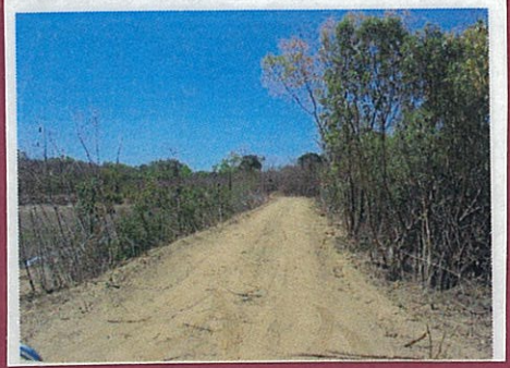
Figure 3. Partially cleared vegetation