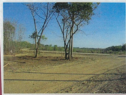
Figure 4. Cleared vegetation