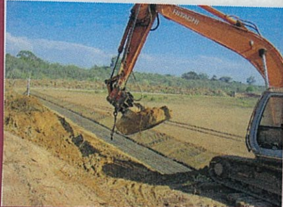
Figure 11. Sept 05. Pond 4