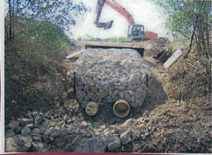
Figure 8. Sept 05. Construction of Drain/Intake for Pond 1 on creek side.