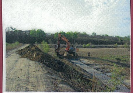
Figure 10. Sept 05. Pond 3