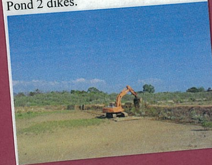
Figure 9. Sept 05. Re-enforcement Pond 2 dikes.