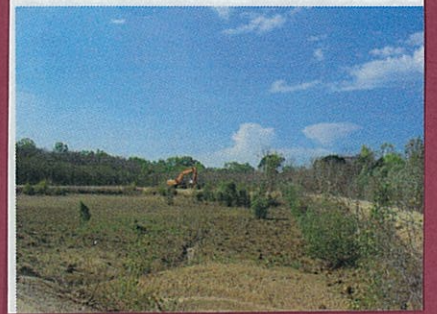
Figure 7. Sept 05. Pond 1 from SE corner of pond near easement.