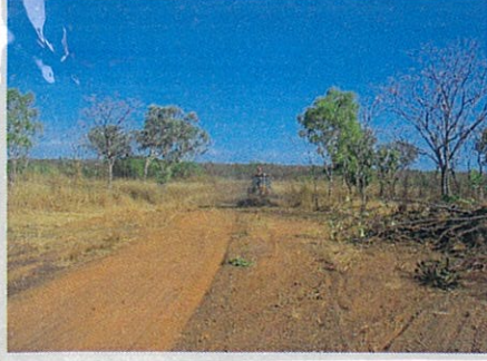
Figure 2. Service Road along easement