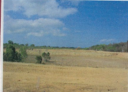
Figure 14. Oct 05. SW view from Pond 1