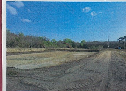
Figure 15. Oct 05. Settlement pond 1