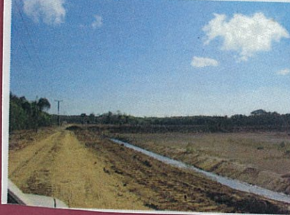
Figure 12. Sept 05. Pond 3