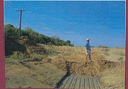
Figure 13. Sept 05. Pond 3