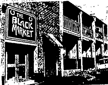
The smart exterior of the new supermarket in Louis Street, Chippendale, with the sign and awning in the colours of the Aboriginal flag. Alongside are some of the houses renovated for Aboriginal tenants by the Aboriginal Housing Company.

It was a great day for the Redfern-Chippendale area on 10 October when yet another Aboriginal dream came true. Although there are Aboriginal general stores and co-operatives elsewhere in Australia, usually in isolated places, the Black Market is the first commercially owned and operated Aboriginal supermarket in Australia competing in an inner city position in an Aboriginal heartland.