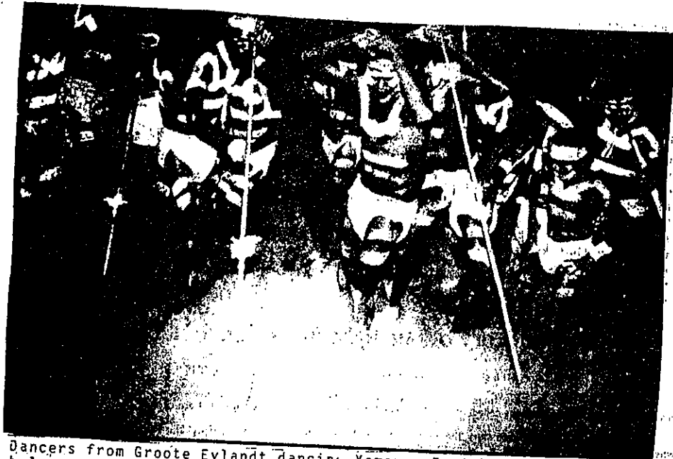
Dancers from Groote Eylandt dancing Yamara, East Wind. This dance belongs to the Amugala and Mamarika clans of Groote Eylandt.