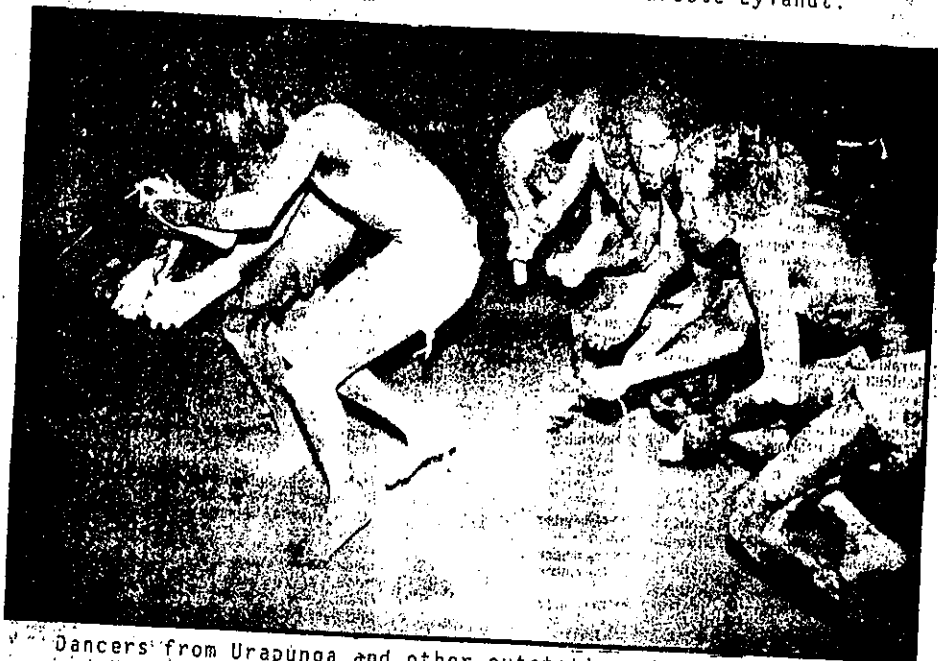
Dancers from Urapunga and other outstations between Bamyiii and Ngukurr dancing in the bungelin-bungelin style