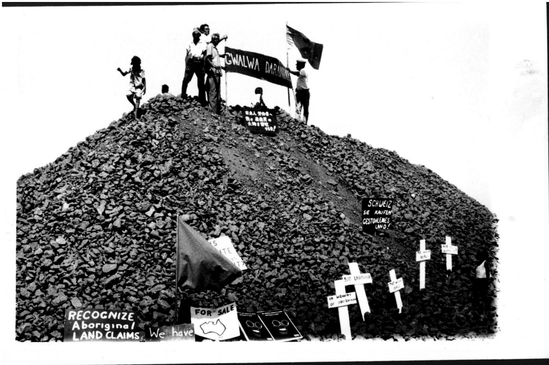
Plate 1: (Above) On top of the iron ore stockpile, Darwin wharf, 14 July 1972.