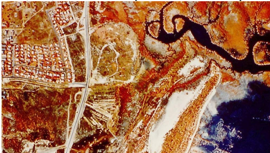
Illustration 2 (above): The Ludmilla Dump site in 1984 after the construction of Dick Ward Drive in the early 1980s and before Minmarama Village in 1986-9. The unused trenches are clearly visible.