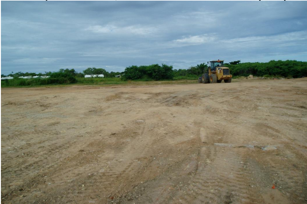
Illustration 5: What lies beneath? Levelling of unofficial extensions made to Ludmilla land fill site behind Minmarama Aboriginal Village (village rooftops visible, rear) in 2009. The area was used to dump unspecified construction waste in an arrangement between the leaseholders and a Darwin construction company. Previously Minmarama residents had used this area as their private dump. The residents complained when a locked gate was installed, restricting usage to a construction company which held the key, allegedly Venturin. In 2018, the NT EPA wrote, “Officers are unable to locate any permits or approvals granted by any government agency for reclamation behind Minmarama Village.”