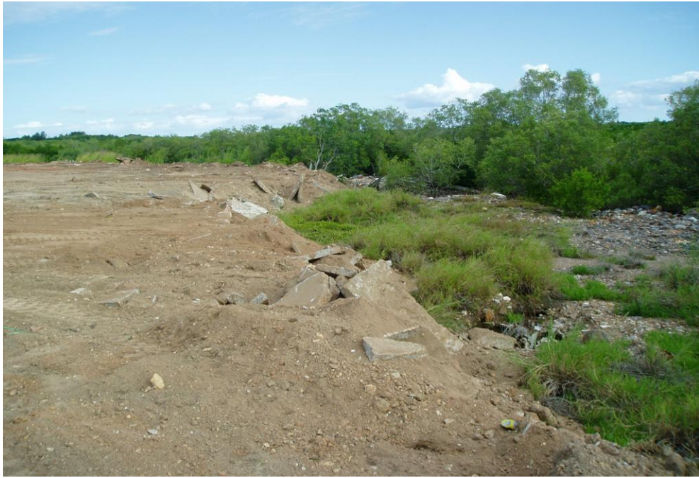
Illustration 4: What lies beneath? Extensions to Ludmilla dump behind Minmarama Village in 2009. (Also visible on previous aerial photo, Illustration 3). Photo sent to the EPA in 2018, taken by B Day, 2009.