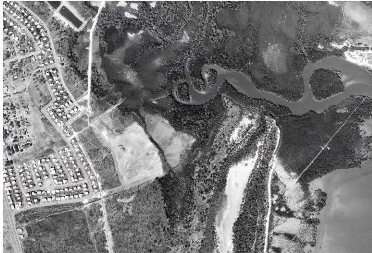
Illustration 1 (above): The Ludmilla dump site in the 1974 before Cyclone Tracy.